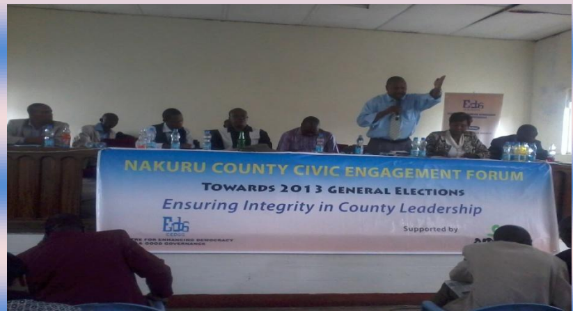
Political Aspirants engage electorates during a Nakuru County Civic Engagement Forum in Old Town Hall, Nakuru Town.

demonstrated during the Nakuru County leadership vetting forum held on the same year. Specifically, the project was undertaken in Molo, Kuresoi and Nakuru Town Constituencies.